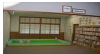
North Branch Library