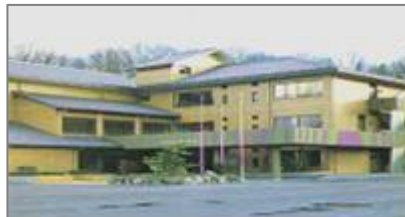
Library in Sakahogi Town Central Community Center