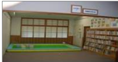
North Branch Library